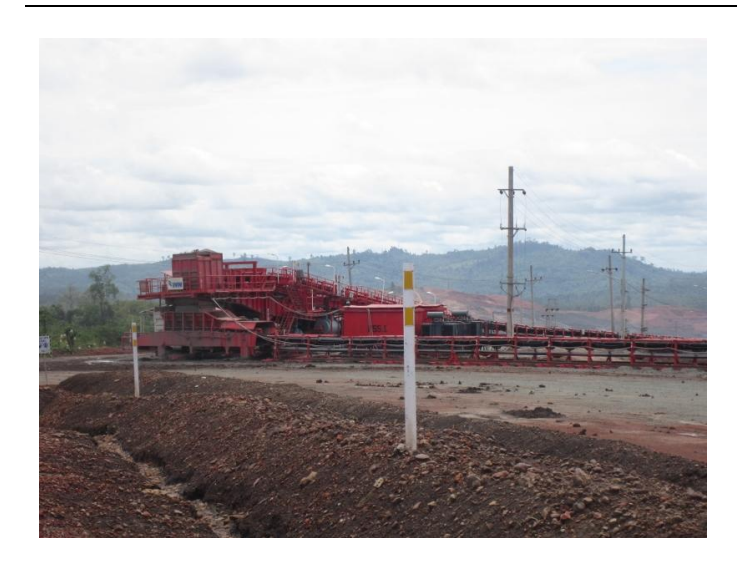
Exhibit 02. The New IPCC at Indominco's mining area