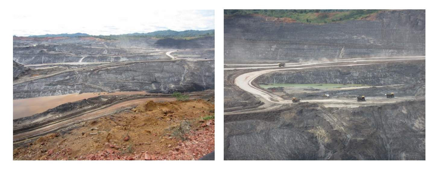
Exhibit 01. Mining activities at Pit 19, the largest pit at IMM's East Block

The management is targeting coal production of 29.5mn tons in 2014. Hence, we can infer a slight increase in quarterly coal production to 7.8mn tons in 4Q14 (from 7.7mn tons in 3Q14) in order to achieve the target. The company's coal production is expected to stay flat in 2015, reaching about 30mn tons, with a lower stripping ratio than 2014's expected 9.8x. With lower demand for coal in China, ITMG plans to redirect a portion of its sales previously intended for China to India and Thailand in 2014 and 2015. Note that in 9M14, China accounted for about 25% of ITMG's total sales volume.