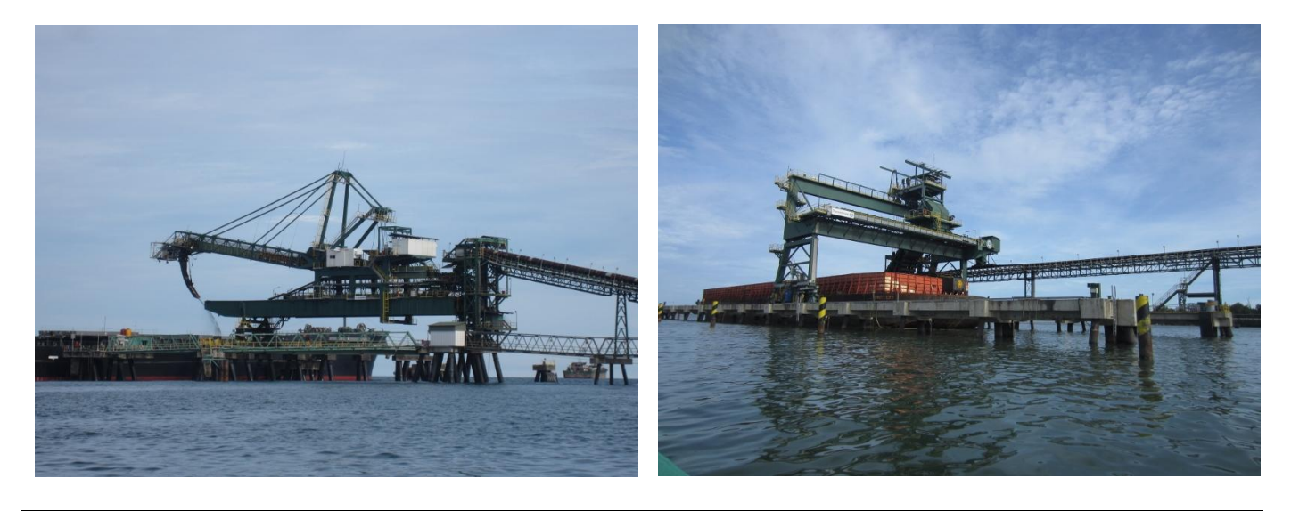
Exhibit 03. Ship Loader and Coal Barging Unit (CBU) at the Bontang Coal Terminal